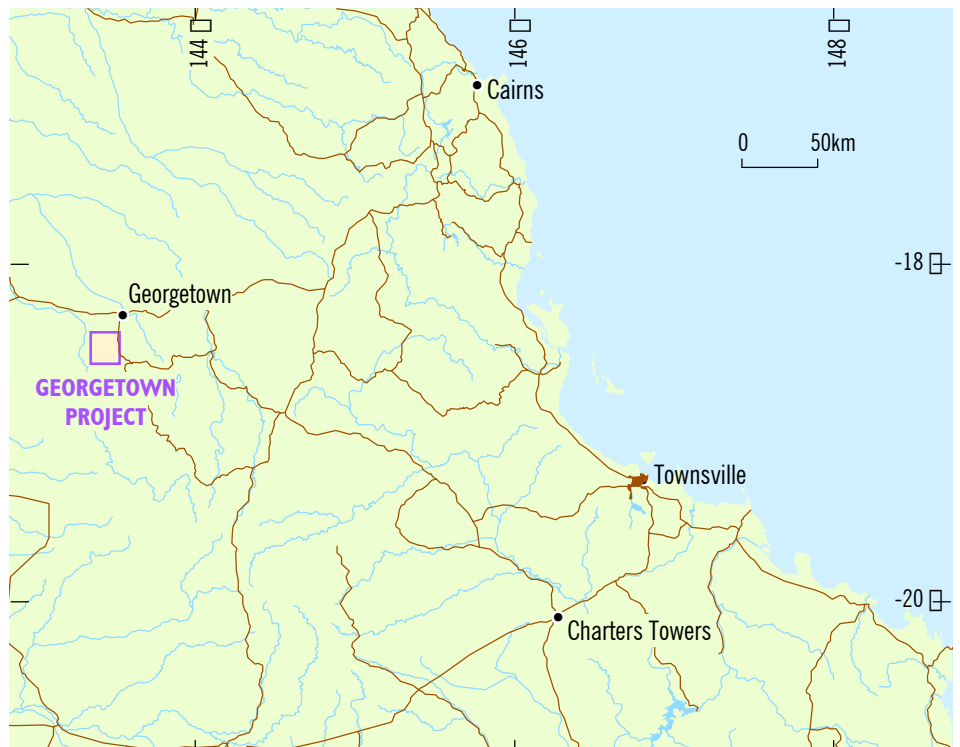
Figure 1 Location of the Georgetown Gold Project.

The project area is subject to pronounced wet and dry seasons that cause restrictions on mining activities during the peak of the wet season. As a result the alluvial gold mining is conducted from March to November of each year with no gold production during the December to February period.