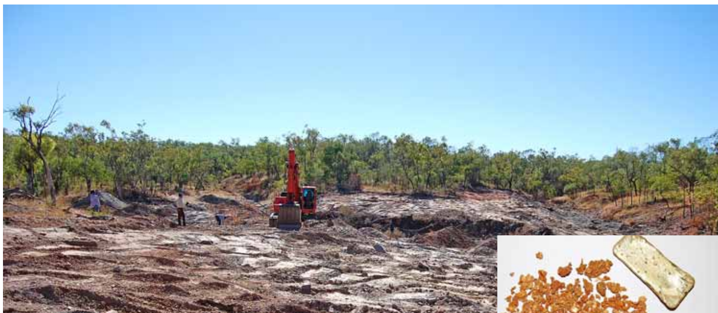
Mining operation Area 1 - April 2009.