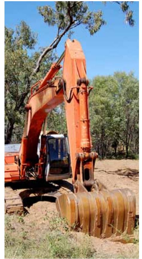
Conventional excavator mining - April 2009.

Mining is conducted utilising a conventional excavator/truck configuration with the gold bearing alluvial wash hauled from active mining areas to the centrally located gold recovery plant. Quality control during the mining phase is relatively simple with a thin topsoil layer removed prior to excavation of the alluvial gravels. The gravels are visually identifiable and rest immediately on weathered basement. Rehabilitation of mined areas is conducted on an ongoing basis in order to limit the area of ground disturbance to a maximum of 2 hectares at any point in time. The mining and processing activities are supported by a fully equipped workshop, office and accommodation facilities.