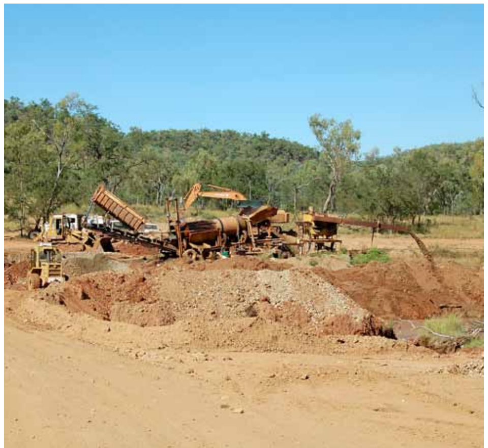
Main plant operating in Area 1 - April 2009.