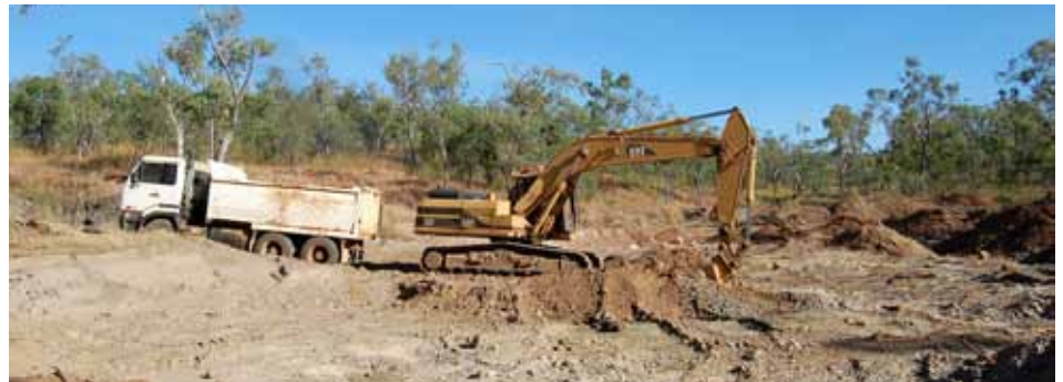
Mining operation - April 2009.

It is the Company's intention to immediately embark on a program of bulk sampling that will be designed to confirm the earlier test work and allow for the publication of a resource estimate conforming to the JORC guidelines. A 25 lcm/hr test plant will be constructed from surplus equipment, acquired by ERO as part of the current transaction. This plant will be operated in parallel with the main production plant with the objective of validating the Company's current Exploration Target.